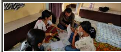
Session on mental health and substance abuse

A two-day training on Prevention of Suicide and Substance Abuse was conducted on 16th–17th February, with 21 participants (4 staff members, 13 youths, and 4 MITA team members).