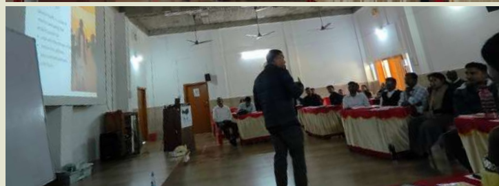
MITA Annual Meet discussions