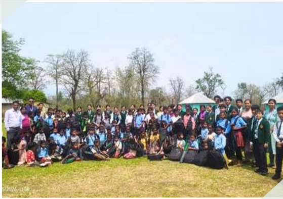
School visit group photo, Deosiri.