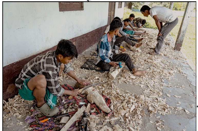
5 days Serja (Bodo musical instrument) making workshop at Rowmari organized by Sifung