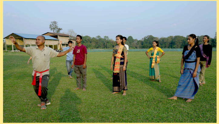
3 days Bodo traditional dance TOT workshop at Rowmari organized by Sifung