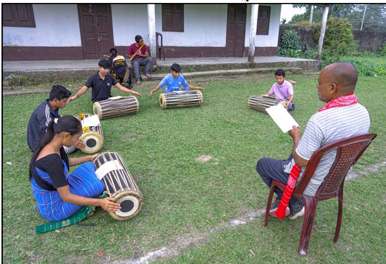
3 days Kham (Bodo musical instrument) Learning workshop at Rowmari organized by Sifung