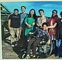
[Schna - 2021]