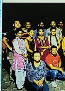
DBIM, KHARSHULI | 25

Celebration of Pride Month by IDEa reaffirming their dedication to cultivate a diverse and empowering workspace.