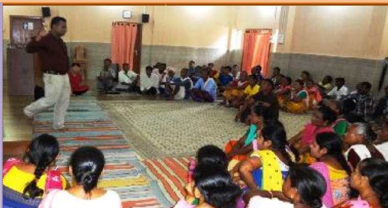
(Above) – Traditional Faith Healers (called "ojhas") attend our call for collaborating to heal mentally ill patients;

But on insisting that we want the best treatment for our patients - and if we could jointly explore together, we won them over. They are now ready to come to our meetings any time and have been requesting more such programmes!