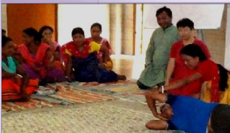
(Below) – a demo by our team on correct management of an epileptic patient