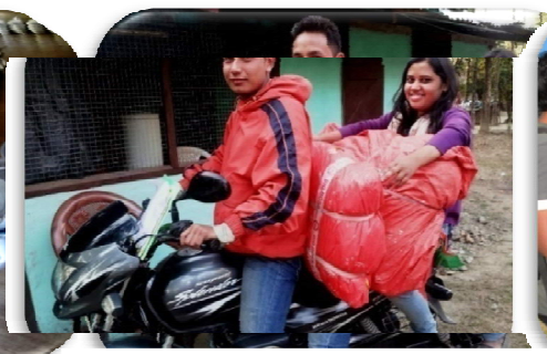
Our volunteers make innumerable trips to and fro with tenting materials as there were no vehicles to hire in the many days of bandhs. We distributed 850 tarpaulin and 500 blankets.