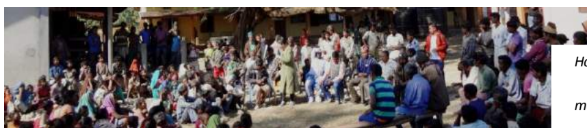
Holding a meeting with Relief Camp inmates in Deosri and also various local organisations to discuss camp management issues. 3 Adivasi relief camps with 10,000 population came up on 26 th December next to our field

It is one and half months that people have been living in the relief camps. There is a crisis brewing as the government has declared the camps closed to force people back to their homes. Camp inmates refuse to go unless the government gives them in writing what their compensation will be, how they will rebuild their lives and how they will be protected from further attacks. Hunger stares in the face of the inmates as rations have stopped and so has health care. We are trying working to help break the deadlock between the people and the authorities. Because of this crisis, the regular development activities in Deosri supported by the Arpan Foundation (U.S.A) was disrupted , but our team there has managed to get on track some of the regular work.