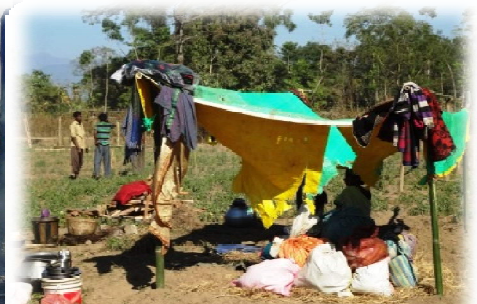
Families live in the open under make-shift tents in Deosri relief camp. 850 plastic tenting sheets were distributed to such families.