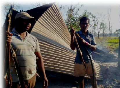
Men from Koraibari guard their village after 25 houses were burnt down. Burnt grains smoulder even 5 days after being burnt.

Thanks to donations from Caring Friends , we could give relief to thousands of families. Supplementing inadequate government supplies, we distributed blankets; tarpaulin sheets; soaps; masala packets to over 2500 families in relief camps.