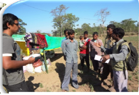
Ant team getting camp inmates to organise their tents so that 7500 people in Deosri LP School Camp have space to stay and also makes relief distribution more manageable.

Currently, we are supporting coaching classes of matriculation students who have been displaced. We helped the Students Unions of both the Bodo and the Adivasi communities to start residential coaching classes and apart from paying for full time teachers, we are supporting with supplementary food items like oil, daal, masalas etc. We are also working with other NGOs to see if we can start Cash-For-Work Programmes etc.