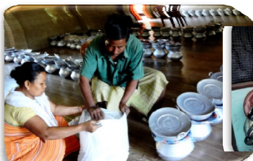
175 sets of cooking utensils were distributed to families – both Bodos and Adivasis - whose houses were either burnt or looted.