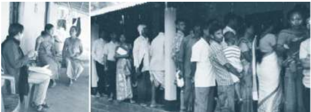
Left: Patient follow-up by our staff. Right: The patients await to see the doctor at the mental health camp.

The shadow of the violent conflict last year fell on our mental health work too. We were unable to hold the camp for one month because of the curfew and patients ran out of medicines. Even when the treatment camp was held, many of our patients were either still in the relief camps or could not travel. For us, it is heart breaking to see patients who have gotten well relapse back to their former state of mental illness.