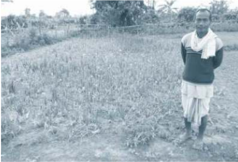
Top left to right: Farmers' Shoppe – pesticide-free products; tomato and onion crops. Above: A farmer in Deosri.

make some headway. We could form 59 of the targeted 100 farmers' groups and supported them through the 6 Farmers' Resource Centres across the 6 clusters.