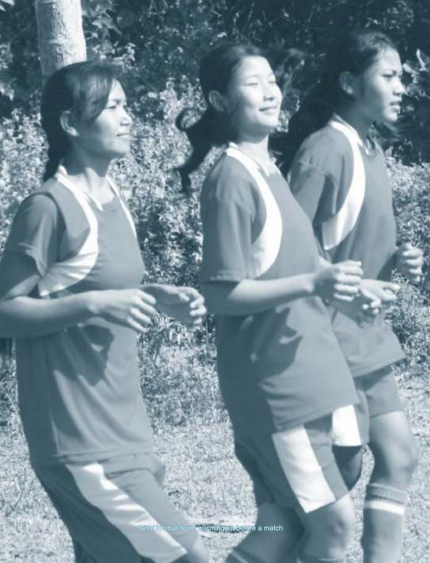
Girls' football team warming up before a match