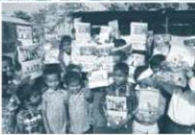
Top: Distribution of cycles. Bottom: Relief camp kids with their new notebooks ready for school