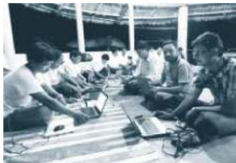
IDeA's long course NGO partners get used to laptops donated by Infosys

The Institute of Development Action (IDeA) completed five years. It was set up with a mandate to build up strong local NGOs who will do effective work with communities and hence bring about change. And if we have enough of such organisations, the entire voluntary sector in the Northeast will be strengthened. Supported by Sir Dorabjee Tata Trust (SDTT), IDeA has a clear enough mandate but that which translates into a Herculean task. Those in any kind of leadership position quickly learn that many a times it is much easier to do the work ourselves than to get it done by others! So it is the same working with NGOs. We may work with them, train them and prepare them but finally, the individual NGO decides how they will perform. This learning came home starkly in our Long Courses which were conducted over various phases spread over 9 – 10 months with hand holding support in the field by our faculty.