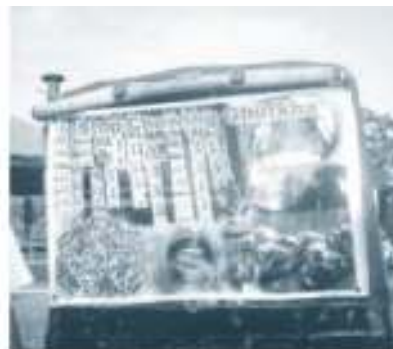
Campaign by youth

Then, this year we trained the Youth Parliaments to carry out social campaigns. Campaigns are a powerful way of engaging with youth to take part in social change. This year, the youth of different clusters worked together and carried out a Cycle Rally cum Campaign to raise the issue of Early Marriage arising out of the misuse of mobile phones by youth. Over 50-60 youth cycled around 90 kms through heavy rain and storm for 4 days to spread awareness about issues which they were concerned about – substance abuse and early marriage. They were hosted by youth from the host clusters all along the way. They were welcomed by student leaders and had discussions with them. In open meetings other young people took the oath not to run away and get married before the legal age but to continue their studies.