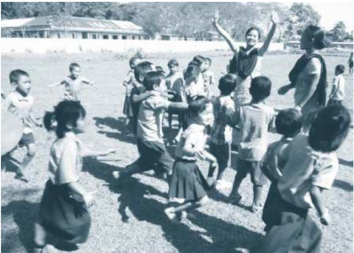
Celebrating Children's Day in Birhangaon Primary School

It speaks volumes about the resilience of children and also of our work with them. Even as the adults fought it out, lost sleep, plotted and planned destruction, our children continued their football coaching in Rowmari and then slowly in our other clusters. After the initial few weeks of shock and derailment, our children's programme was the first to recover and get back on track. It was strange at first but also very reassuring to hear the happy sounds of children seriously at play in the midst of the long periods of curfews and bandhs, moments when even the flights of birds were suspended in the thick air of tension. It made us feel that at least something was right with a world that had suddenly turned horribly upside down. The children must have felt it too as many fought opposition from their homes to continue coming for their football coaching camp when there was tension all around.