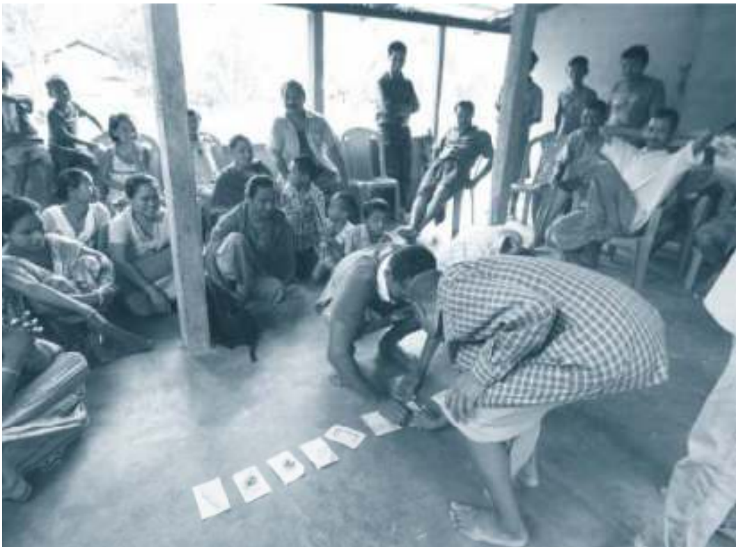
Village baseline evaluation study by IDeA for Bongaigaon Refinery.

Bongaigaon Refinery Baseline Study: Using both quantitative survey method and also participatory methods of PRA, we helped Bongaigaon Refinery of the Indian Oil Corporation to carry out baseline studies in 18 villages in Chirang and Bongaigaon Districts. There is an attempt by all Public Sector companies in India to move their CSR work from a charity orientation to community development. Bongaigaon Refinery being a part of Indian Oil was keen to find out the status of villages within 10 kms of their refinery plant and after understanding the development needs of the villages, to address the issues. It was a very rich and meaningful exercise as we could help the villages articulate their needs and then see that those needs are developed into projects which would help the poorest families and villages build up their assets – like having much needed pucca latrines in the households, building community halls or repairing of the schools etc.