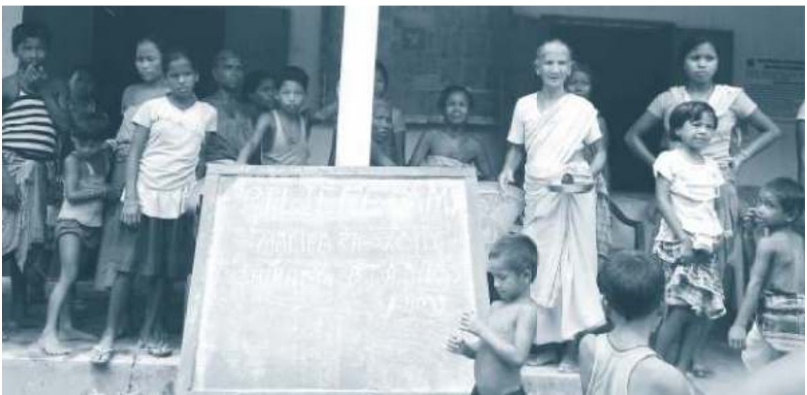
Some of our weavers with their families living in relief camps

After the initial shock, we reacted and acted, sometimes not very wisely but doing whatever we could. The problem was immense and we constantly despaired that what we were doing was too little. But then we would console ourselves that this little bit was also important. In fact just being and remaining around also seemed important. Some of us who could easily be seen to be from none of the conflicting communities, rushed into the conflict area before even the rations or the security forces took control, to be with the people! Distributing relief rations, supplying relief materials, sharing safety and security concerns, addressing breakdown of relationships between communities and fearing communalisation within our own team . . . these were new challenges for us. We have done with and learnt our lessons.