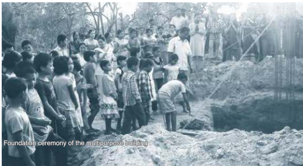
Foundation ceremony of the multipurpose building

Finally after a delay of 2-3 months due to the violence and fleeing of all Muslim labourers, the ground floor of the building got completed. We inaugurated it on the 16th of February 2013. It is already being used extensively – we inaugurated it with a seminar for Lower Assam NGOs on “Conflict in Lower Assam – Role of NGOs”. It is used extensively for our many trainings and programmes. We brought back the Mental Camp to our campus because we now have a place to seat the over 300-400 patients and their relatives while they wait for the doctor to see them. The wheel-chair accessible hall, room and toilet are being highly appreciated. We thank our donors for making this possible. We have started construction of the first floor too which will house 2 dormitories, our project offices, a small reading room and other facilities.