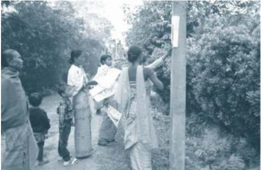
Our federation members campaign violence against women

building work. This we feel is extremely important – that women are supported when they try to come forward to do community work. Each time if they have to spend their own money and also their time, their husbands and other family members might taunt them or stop them from doing this work.