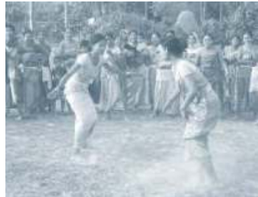
Right: Women at play during Mahila Divas 2013. Bottom left: Campaign by our federation to stop violence against women. Bottom right: Training of federation members

We are working to build up the women to take on leadership roles in the federation and in their community. Apart from training the groups and federations and putting in staff to follow them up, we also support each active federation with a small amount of money every month. With this amount they are able to partly compensate their members for the time and expenses they incur to service member groups and carry out various federation