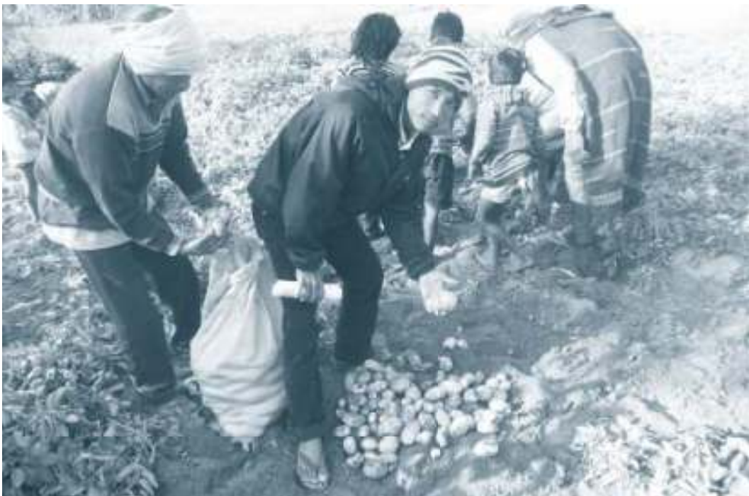
Organic farming at Deosri

By organizing farmers, we hoped to harness their strength as a collective so that they are able to face the huge challenges posed to agriculture – from weathering climate change to falling land productivity, high fertiliser prices, decreasing water table, low selling prices of grains, etc. We thought that organising and moving farmers to chemical-free organic farming might be step forward. And so, with support from the Ford Foundation, we had started doing that some years ago. This year saw our assumptions and work with farmers being challenged like never before. For one, we had found the organising of all-organic farmers' groups difficult but had pressed on hoping that the other farmers would see sense and join in. But that was a strategic mistake. There were too few “pure organic farmers” and we were ending up alienating the majority of other farmers and even if they wanted, we were unable to engage meaningfully with them to start talking about organic farming. Hence, we have started forming farmers' groups, irrespective of whether they practice organic or inorganic farming at this moment. Farmers have responded positively to this and we have been able to